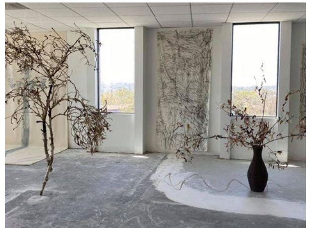
Among the rich work of Hung Viet Nguyen on display