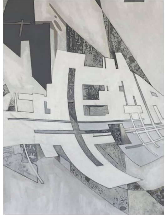
Detail of a wonderfully geometric abstract work by Alison Woods